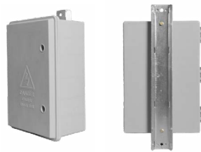
WITH POLE MOUNTING BRACKET (221337)