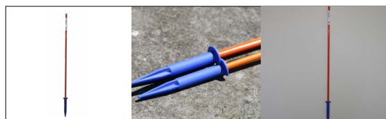
NON-CONDUCTIVE LINE MARKERS 600MM, 750MM, 900MM LINE MARKERS (600MM 102545, 750MM 102456, 900MM 102547)