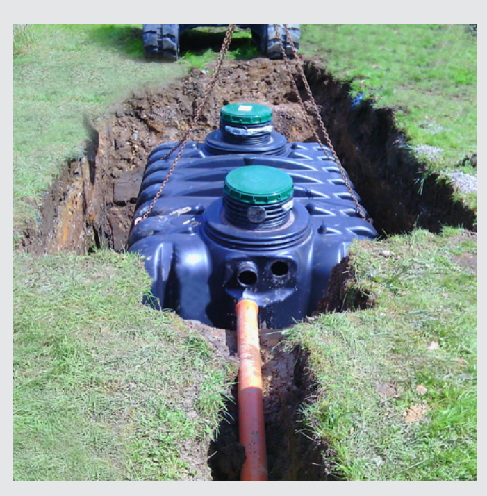
Tricel Vento installed.