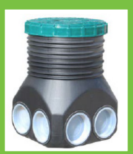
A distribution box is available to help distribute effluent evenly into individual discharge points.

If flexible invert levels are necessary, risers are available for deeper installation requirements and sold separately. When risers are in use, they are necessary on both the inlet and outlet sides of the Vento septic tank. Each riser is 180mm high and can be used to a maximum height of three risers.