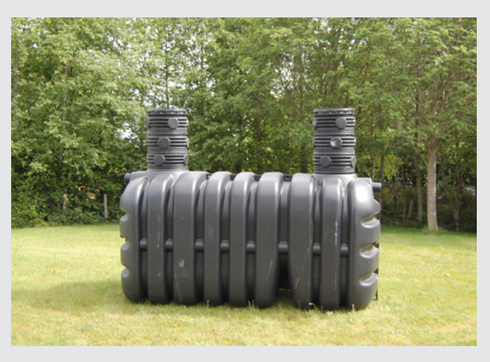
Tricel Vento with risers.