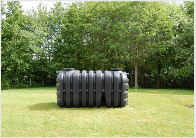
Lightweight and easy to handle.