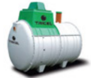
Novo Domestic wastewater treatment plants