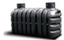
Vento Septic tanks