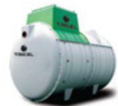
Rainwater harvesting systems